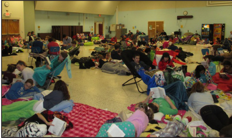
Relaxed readers during the 2014 Read-a-Thon!